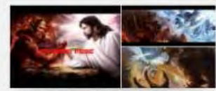
Vs Heaven War